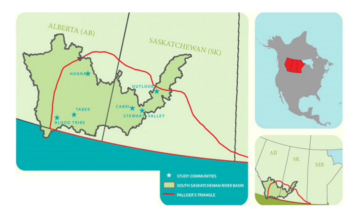
Figure 1. Map of IACC Study Communities

opportunities are considered adaptive strategies . The system's ability to employ adaptive strategies reflects its adaptive capacity . This report is organized according to the vulnerability approach (Figure 2). It begins with a brief description of each community, followed by the key findings of the community vulnerability assessments.